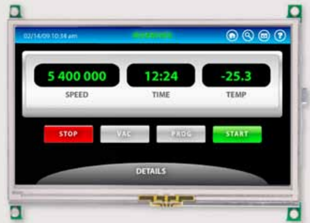
4.3-inch LG Phillips Display Module front view

Reach Technology, Inc. reserves the right to make changes in design or specification at any time and without notice.